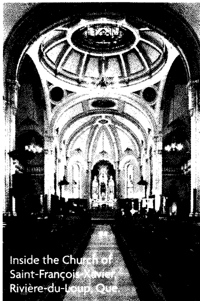
Inside the Church of Saint-François in Rivière-du-Loup, Que.

or more, there's something for everyone. And if a quieter day is in order, the narrow, winding streets — reminiscent of many small European towns — are easily navigable and peppered with the heritage, neo-classical architecture indicative of the region, as well as tiny shops and modern boutiques. Café L'Innocent , a joint café-art gallery, and Bis la Boulange , a wonderful little bakery that will make you throw out whatever diet you're struggling to maintain, are two we didn't regret visiting. Rivière-du-Loup is a worthwhile stop, and will give travellers a more rounded view of the province when combined with Quebec's big cities. Bon voyage! — Travis Persaud